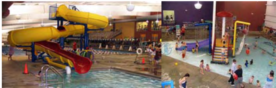
Figure 3.16: Images of Silverlake swimming pool, which achieved a reduction in backwash of 80% using two AquaKLEAR units.

A set of data was taken for a two week period November 3-13, 2006. This was compared with data from the previous year to check it was typical. AquaKLEAR units (a P100 and a W63) were put in place and data was collected from November 13-26 with the units operating.